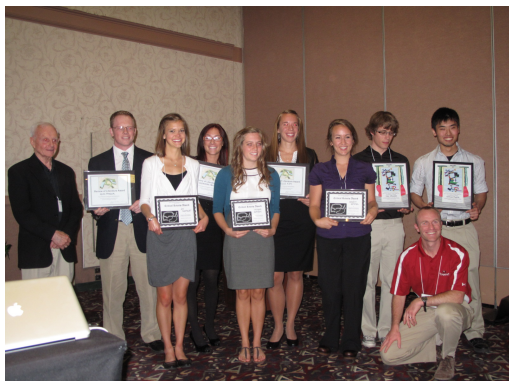
Peavey Paper Award Winners